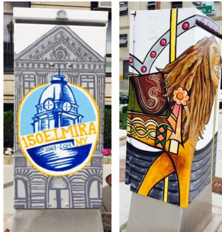
City of Elmira Historic Building (5) and Sebastian the Lion (4)