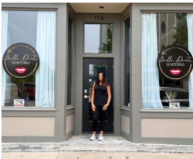
Riverside Suites Water St (right) Bella Denti Whitening Baldwin St (below)

SIGNAGE AND FACADE: Allocates funding for aesthetic and physical improvements to properties and businesses located in the downtown district. The revitalization of a commercial district often begins with improvements to a single building or storefront. Even simple changes such as the removal of non-historic materials, repairs, or a new paint job that calls attention to the building's original architectural details signal positive change and often stimulate similar improvements in neighboring buildings. The Facade/signage Improvement Program has been instrumental in assisting property owners with these types of projects by offering to cover a percentage of the cost for improvements.